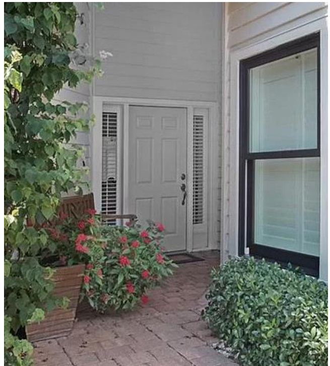
Entrance doors not monotone white