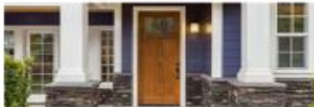
#1 Affordable Residential Entry Doors Near Me