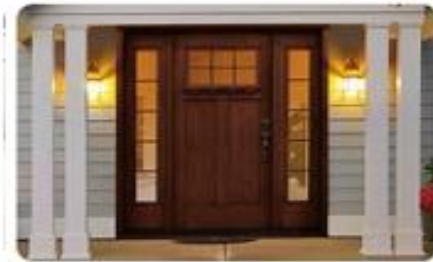
Residential Front Entry Doors for Your Home - Clopay