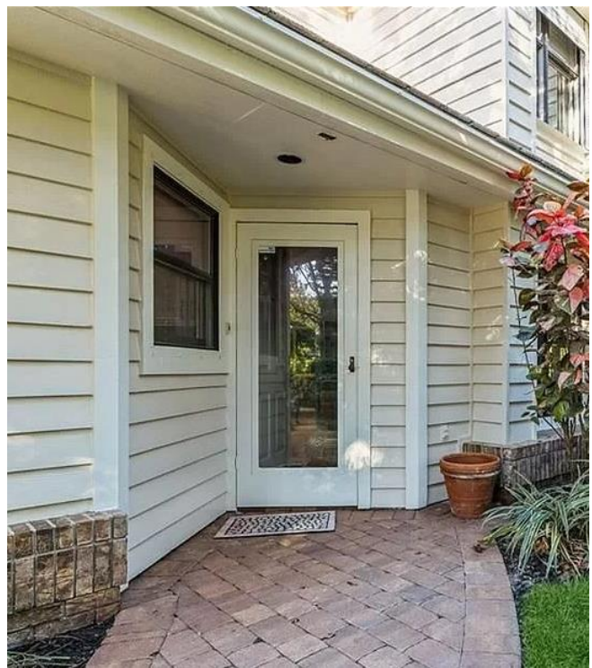
Villas of Pelican Bay Not monotone white