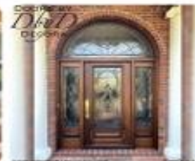
Custom Leaded Glass Exterior Front Door Wood Entry - Doors ...