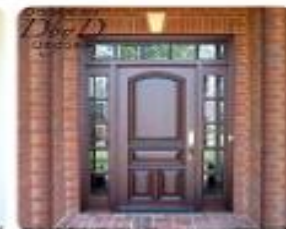
Solid Wood Front Doors With Glass Panels - Glass Designs