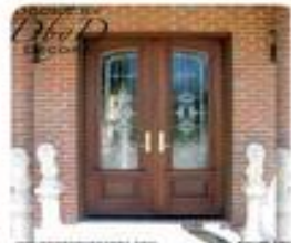
Residential Doors crafted by Artisans at Doors by D...