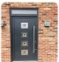
Aluminum doors | Aluminum Front D...