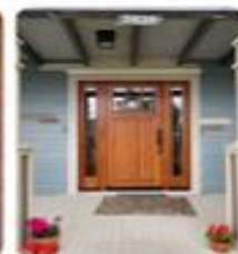
Front Doors For Homes Near Me - BEST HOW...