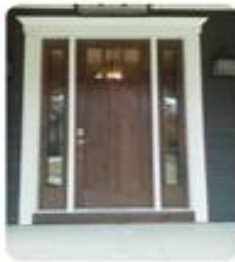
Therma Tru Front Door Done at a house near I...