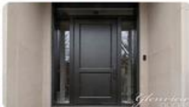
Front Entry Door With Full Glass Sidelites And Transom Exterior View ...