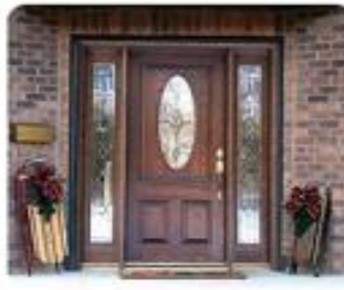
Wood Exterior Doors With Glass: A Stunning Addition To Your Ho...