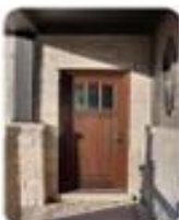
Gallery, EUROTECH (Eur...