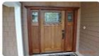
Custom Exterior Doors Near Me - Rickyhill Outdoor Ideas - Design Custom ...