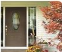
Replacement Near Me - CMC Doors