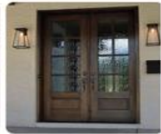
custom made exterior doors near me - Marty Cody