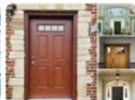
Chicago Fiberglass Entry Doors | Huge Savings! | Virtual Appo...