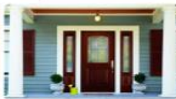
Fiberglass Front Door Sidelights Create Entryway Focal Point | Pella