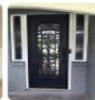
Custom Front Doors near me Houston ...