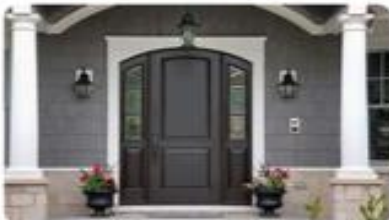
Custom Exterior Doors Near Me - Rickyhill Outdoor Ideas - Design Custom ...