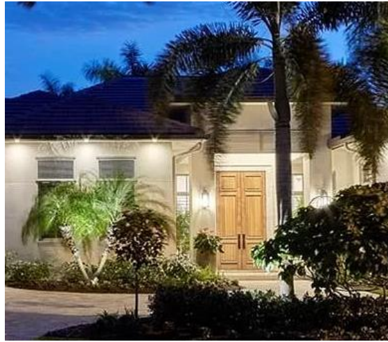
Villas at Colnade at Parkshore Rd =Curb appeal -attractive doors