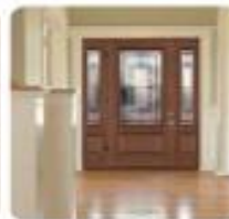
23 White Residential Front Door Ideas