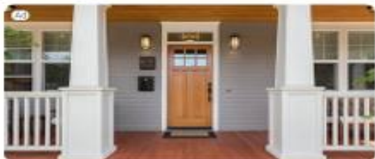
Local Door Contractors doors.hornetusa.com