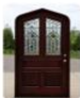
custom made exterior doors (t...