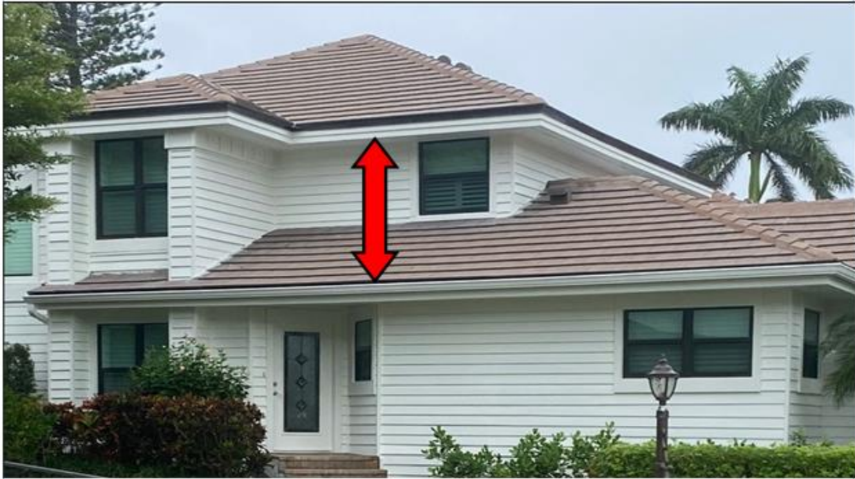
Recently painted with 2 different Facias depending if Gutters installed

Two types of Facias There is an inconsistency in facia depending on whether gutters are installed as illustrated below. This would have become apparent if HOA Board had not rushed the paint decision and had a sample villa painted to resolve details and recognize the need for trim color.