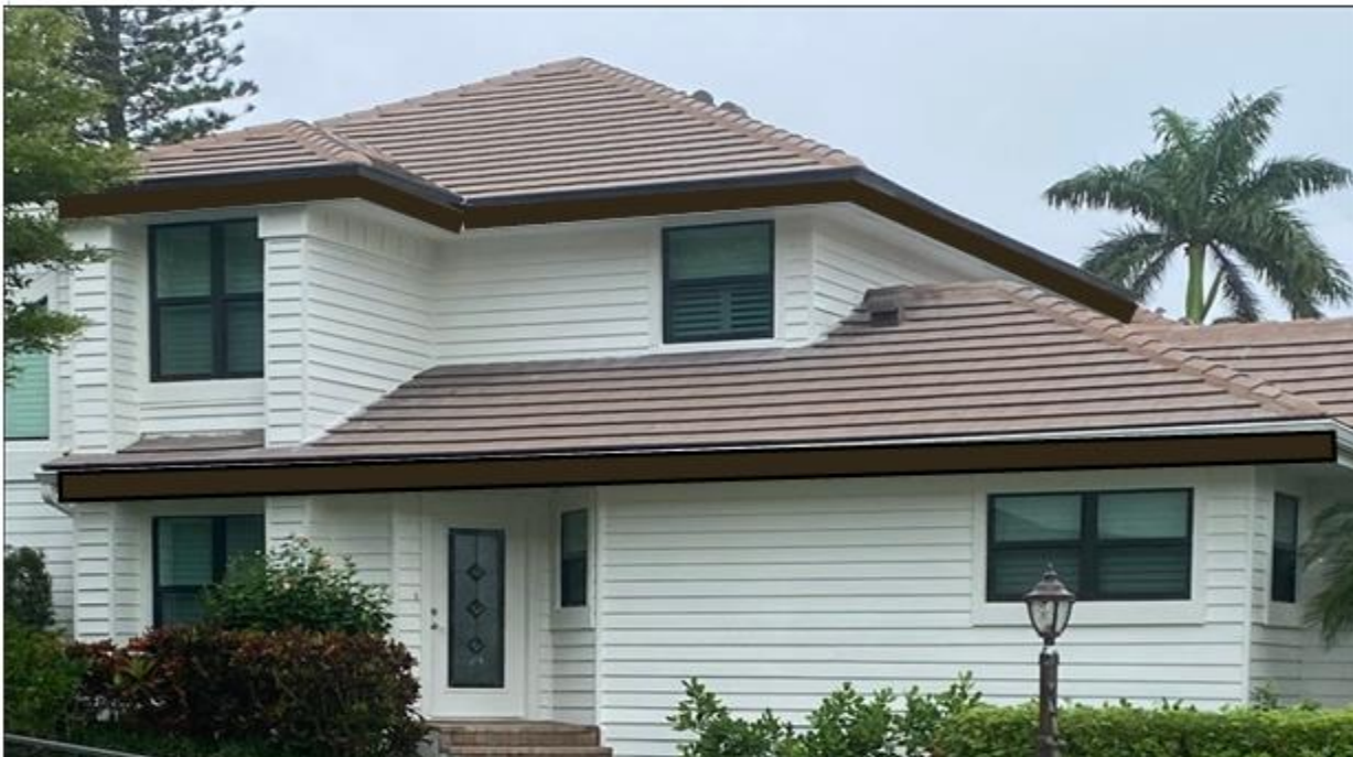
Trim Color facias and gutters resolves inconsistency and enhances appearance