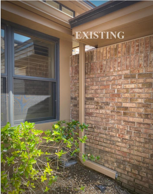
This is what existed which blended with brick.