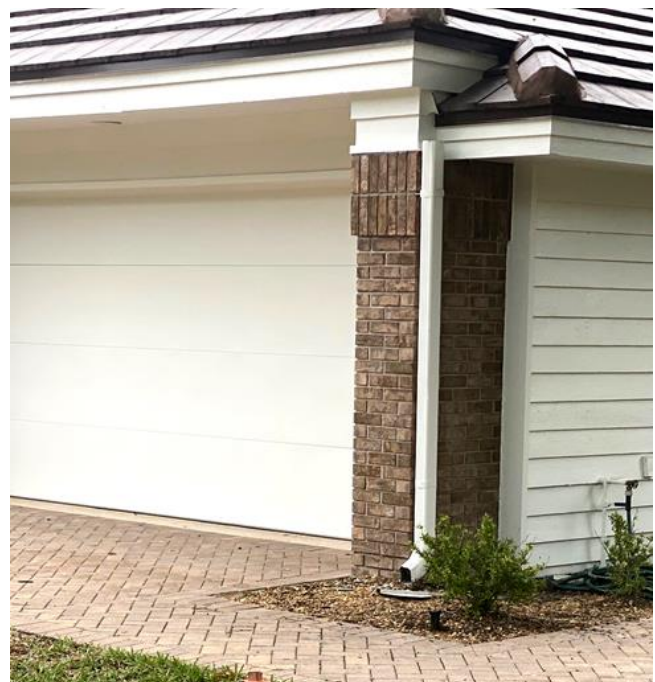
Recently Painted Villa monotone white-conflicting which is a design error.