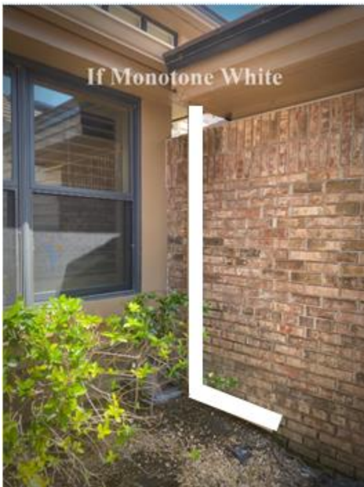
This is new HOA Board approved white conflicting with brick which is a design error