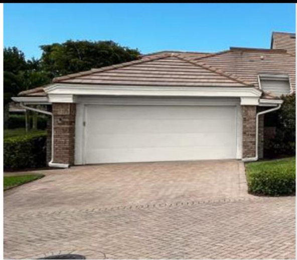
Paint scheme created by a committee-in fairness that is not true- this scheme is encourage by VOPS HOA Board as Paint Committee suggested Greek Villa and Natural Linen be on the ballot for community to vote on

Part 2 to follow regarding process...lesson learned.. and prediction of eventual compromise resolution.